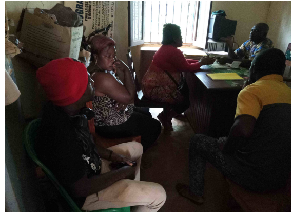
Arrested pangolin scales traffickers at the police station waiting for the commencement of interrogations