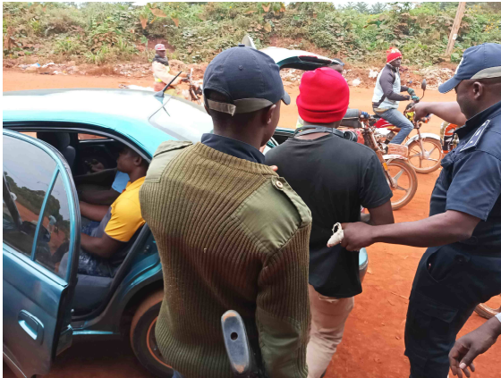
Police officers move pangolin scales traffickers shortly after their arrest in the East of the country