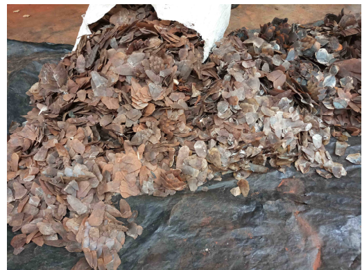
The illegal trade in pangolin scales is driving the scaly anteater to extinction and the scales are hotly demanded in Asian markets; scales seized from the traffickers