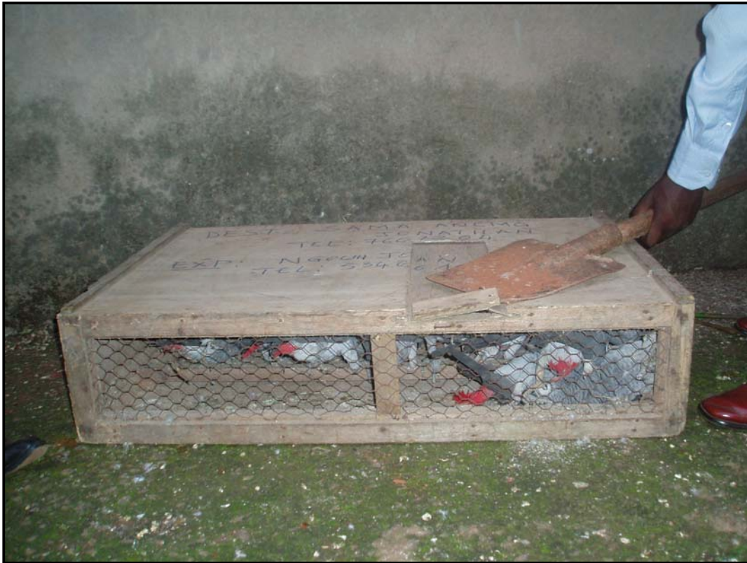
Long-term investigation on African Grey Parrots