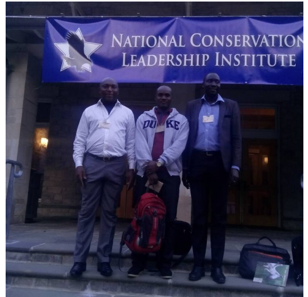
The Deputy Director (left) and EAGLE Uganda Coordinator (right) at the US National Conservation Training Centre where they participated in a workshop