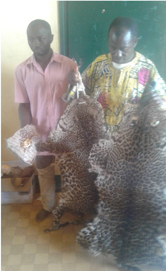
Two arrested traffickers shortly after they had been brought to the gendarmerie office for interrogation on their illegal activity (left)