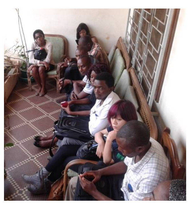
Pangolin Mentor PoP fellows from the sub region and from Vietnam at the LAGA that be the mentor organisation for Legal Systems Action Group