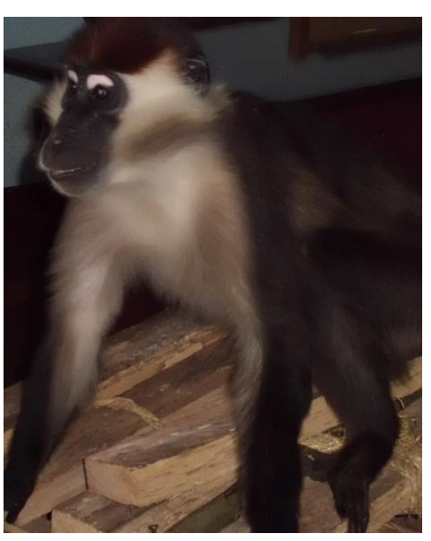
The 3 live primates (from left to right – chimp, drill and mangabey) rescued following the 2 operations that took place within hours in the small town of Tonga – Western Region. The animals were all taken to the Mvog Betsi Zoo in Yaounde – Center for proper care and upkeep.