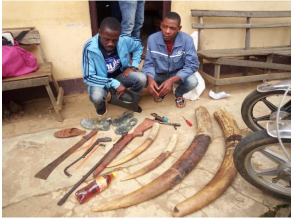
Two arrested are in front of police station shortly after the operation, they had a rifle given to them by widow of a senior police officer, she too was arrested