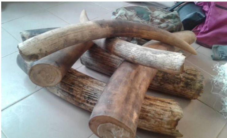
Traffickers travelled a notorious road from the south of the country with ivory and military uniform