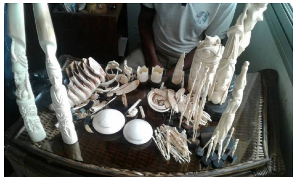
Shopkeeper arrested with over 100 ivory pieces at police station shortly before commencement of prosecution