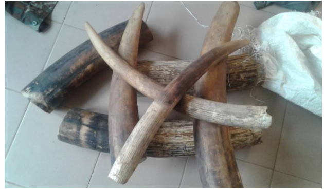
4 ivory tusks cut into pieces were seized from traffickers