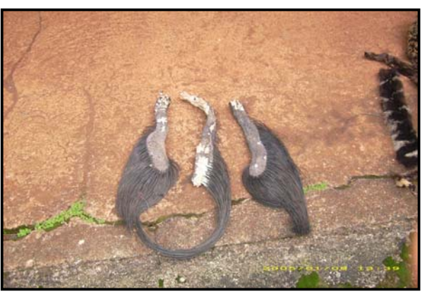
Elephant tails and leopard skin dealer arrested, West province