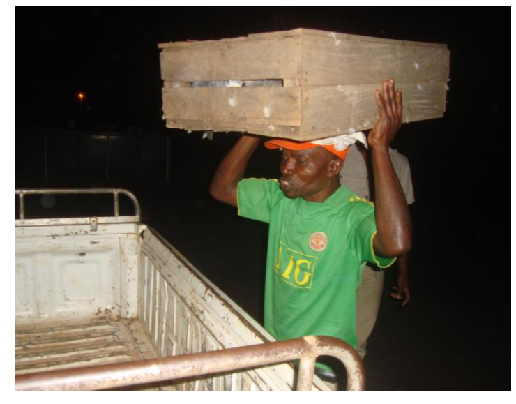
Top Left – military matriculated 4x4 Toyota Hilux pickup used in the transportation of African Grey parrots on several occasions to avoid road control. Top Right - members of the busted network of parrot traffickers during the writing of PVs, 5 of them were arrested. Left - the leader of the network carrying one of the cages containing the African Grey parrots; 72 live parrots were seized. The parrots were being transported from Mbalmayo - Center where they have quarantines and a network of suppliers to Yaounde. Thev also produced illegal documents that he uses to carry out the trade.