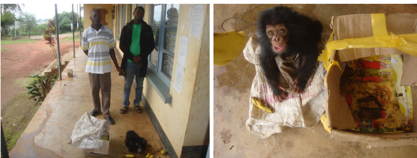
2 dealers in live animals and bushmeat (left) arrested with a live baby chimp while trying to illegally trade in it in Bafut - North West Region. The chimp was provided by one of their suppliers in Wum - North West Region, about to be taken to Nigeria. The chimp was wrapped in a bag and put in a carton during transportation.