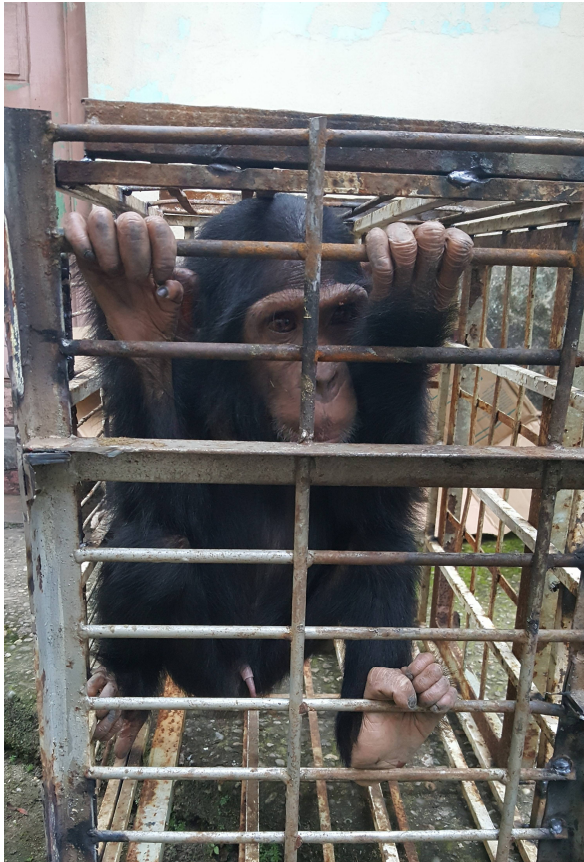
Chimpanzee rescued from two traffickers in Douala, had been living in a state distress