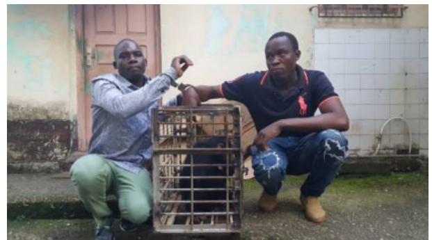
Their case shall be heard in a Douala court.