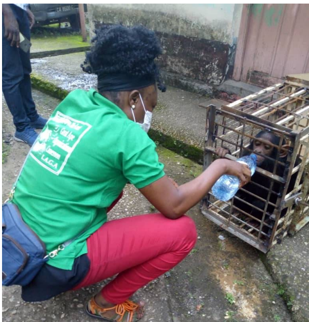
Chimpanzee being given first aid primate care by our media officer.