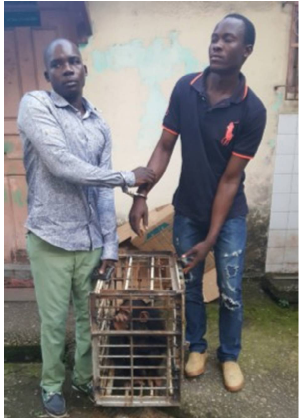
Arrested for unlawful possession of a live chimpanzee in Douala