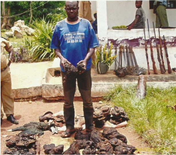
Dealer in elephant products arrested in Ebola – Mindaourou - East. He is known to be a regular dealer in elephant products including ivory. The operation was carried out with MINFOF agents from the East Regional Delegation