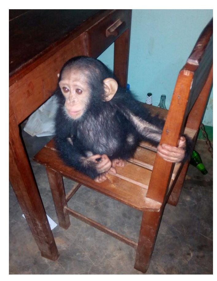
He was seized from a trafficker who had shot, killed and eaten her mother while selling parts of her body to the bushmeat trade, he was too was heading for trafficking (above

A baby mandrill hidden inside a bag and handing to be sold as a pet was rescued from two traffickers who travelled with the baby inside this little bag