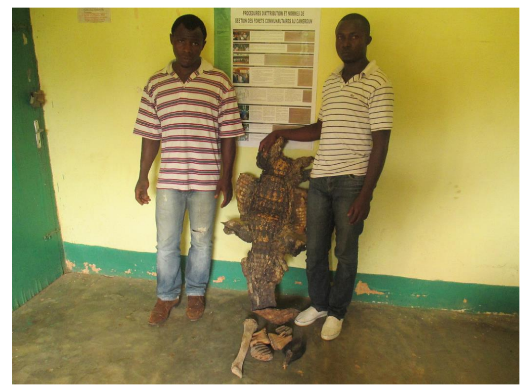
The 2 dealers arrested in Makenene - Center with a variety of elephant parts including bones, teeth and tail, and crocodile skin. They are known to have been in trade for a long time, also trading in ivory and have a ready market in Yaounde – Center.