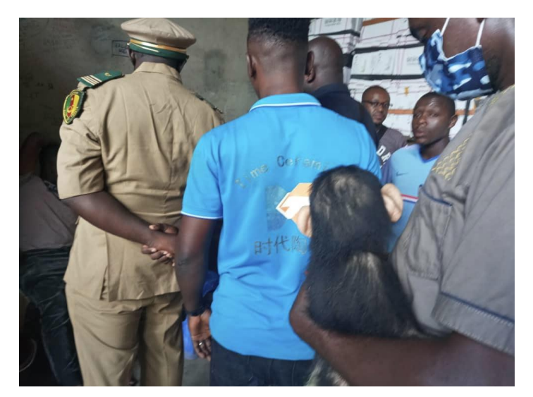
Chimp rescued from the hands of traffickers who gave him cruel treatment. At the Littoral Regional Delegation where the process to rehabilate him is just beginning.