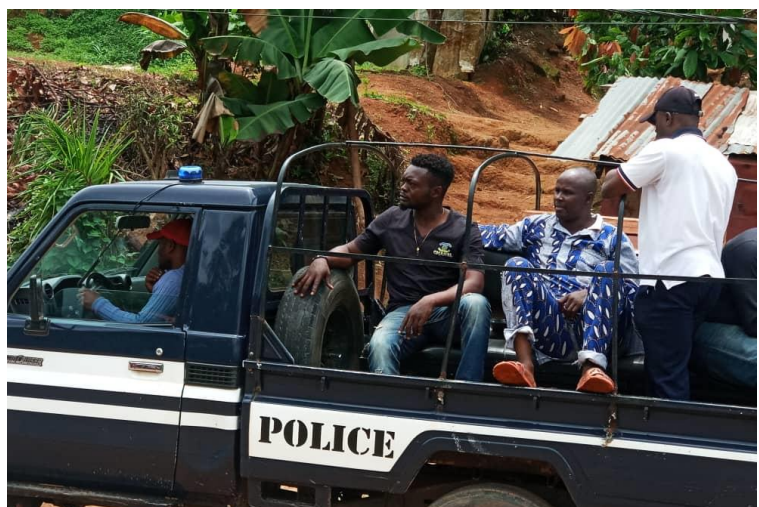
Two parrot traffickers fished out from their hideout and arrested