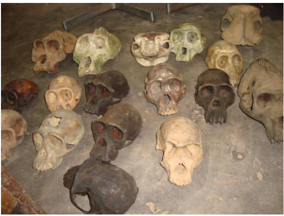
10 chimpanzee and 7 gorilla skulls were found stuffed inside a bag by the dealer. He bought the skulls in four villages in the South Region

Dealer arrested in Yaounde, he travelled all the way from Ebolowa, South Region. He is a seasoned professional, he used a private car to escape recognition by the Forces of Law and Order.