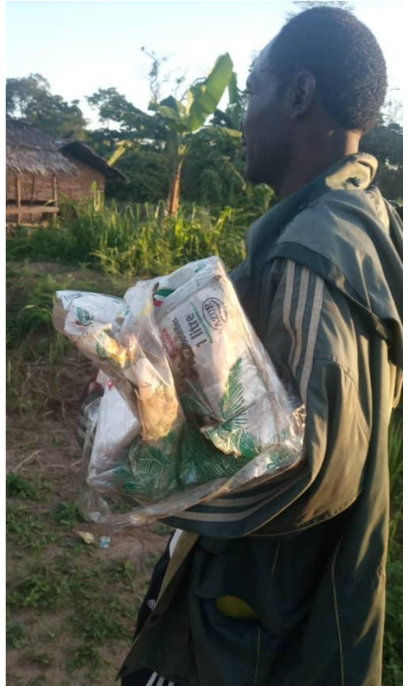
He camped on the banks of River Sanaga with a baby chimp that was later rescued