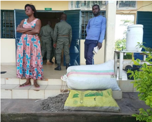
Two arrested in in Mbalmayo in custody of 72 kg of pangolin scales.