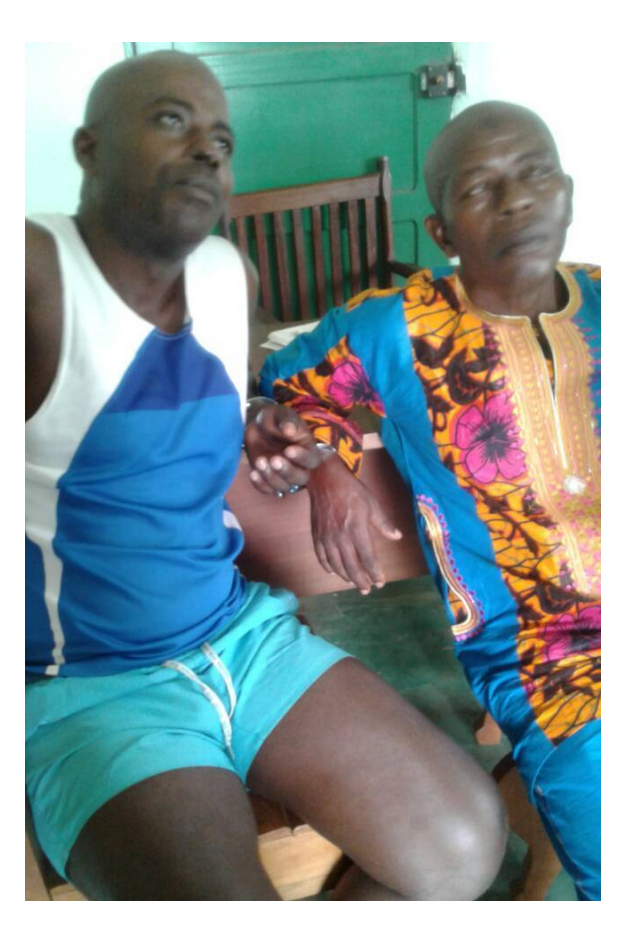
Arrested traffickers waiting for complaint reports wildlife office