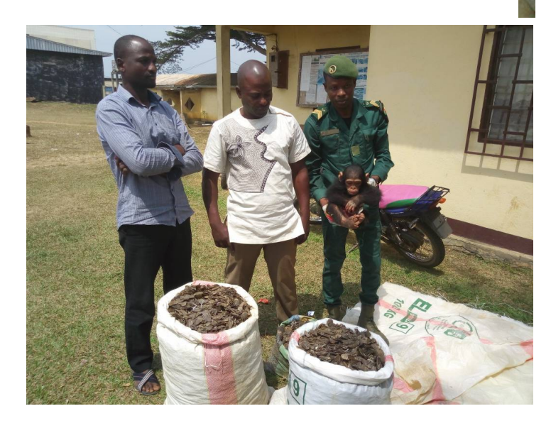
Wildlife officials who carried out arrest with pangolin scales (giant pangolin scales and black bellied pangolin scales) and traffickers being matched off after arrest (right)