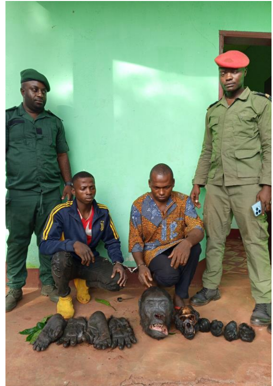
Arrested in Doume for trafficking in fresh gorilla parts, they await interrogation at the wildlife office