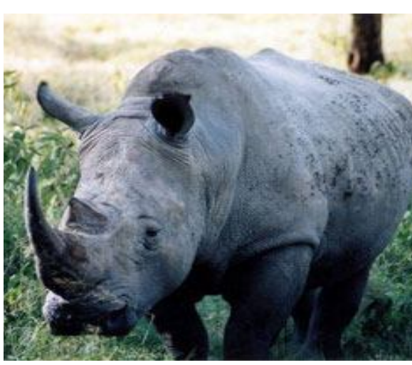
Has the African black rhino gone extinct?

Contemplation by conservation experts to introduce other rhino subspecies in West