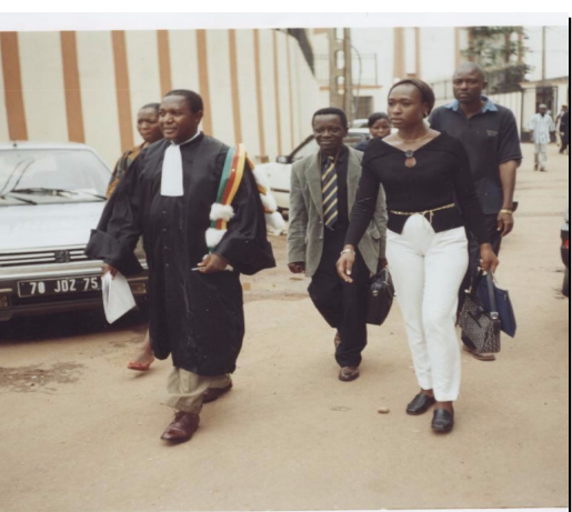
Magistrat incharge of wildlife law enforcement

protected, (can be killed, captured or hunted after obtaining an exploitation certificate) because according to Article 3, if particular measures are not taken, they too will become rare or seriously endangered. To maintain and increase the populations of endangered species, Article 7 states that the list of protected animals must be updated once every 5 years.