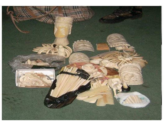
Ivory Prices have skyrocketed

It seems that, despite the 1989 CITES ivory trade ban, the situation is aggravating. "Right now things are really worse than before the ban", Wasser observes, lamenting that, "almost half of African elephants had been