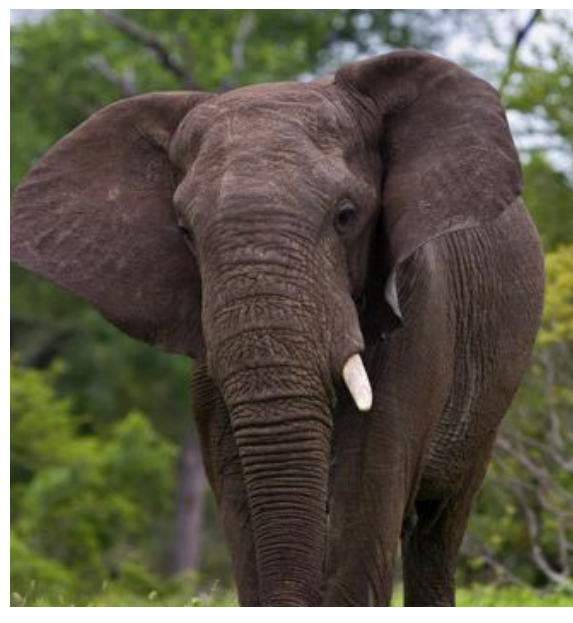
African elephants continue to be killed

Cameroon that has one of the most remarkable floristic heritages in Africa should take major steps to protect frugivorous animals which take part in the propagation of seeds which are responsible for the germination of many different plant species.