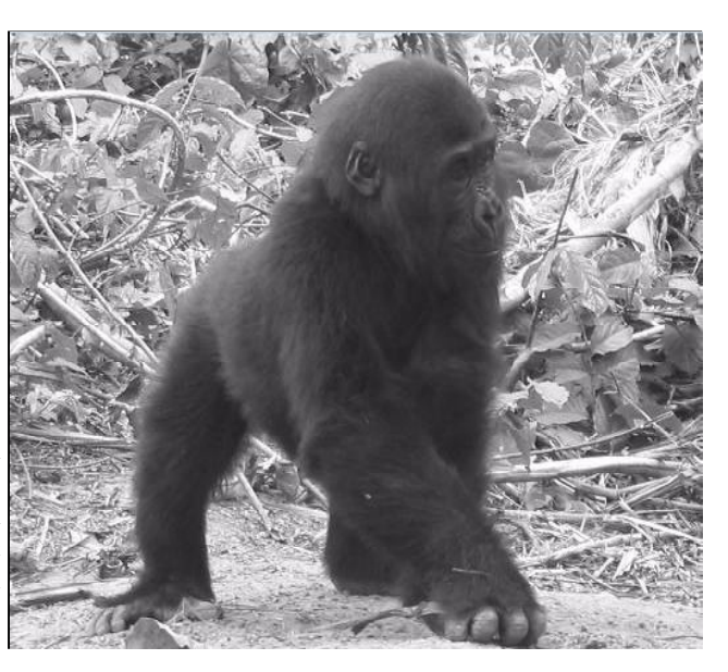
Cross\ River\ Gorilla-most\ \ endangered\ ape\ in\ the\ world.

serious long-term problem for any conservation initiative. No conservationist will lie tranquil when he knows there is limited genetic variance. If habitat loss and fragmentation continue, then this may sooner or later become the cross river gorilla's undoing.