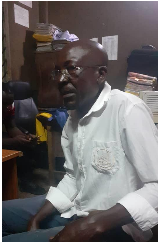
Arrested in Douala in connection with the trafficking of a live mandrill