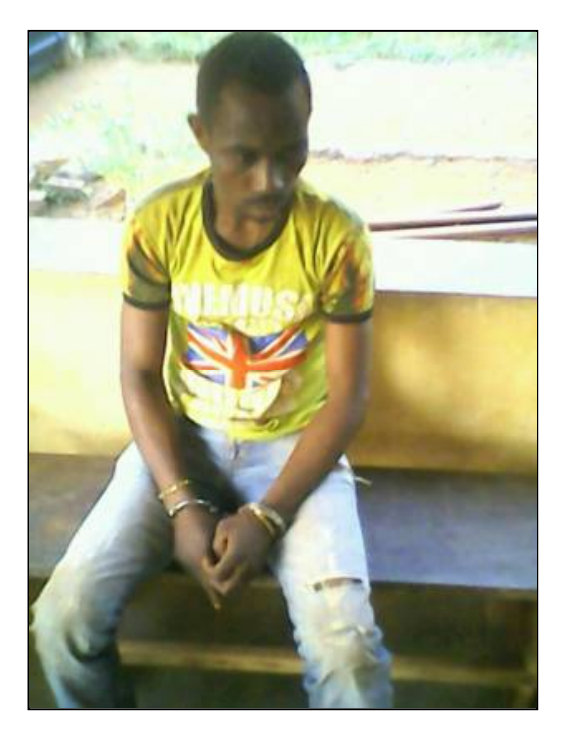
Fugitif (above) arrested after killing Moon, pictured below.