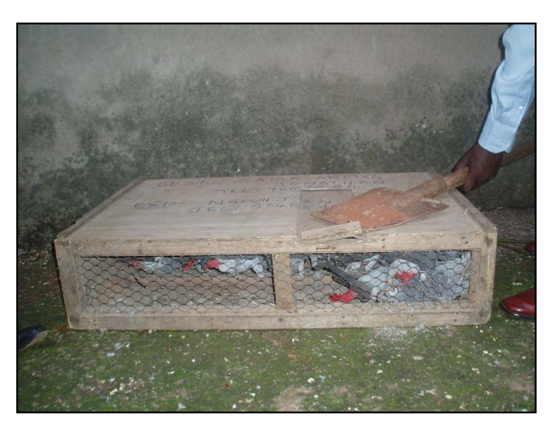
Long-term investigation on African Grey Parrots