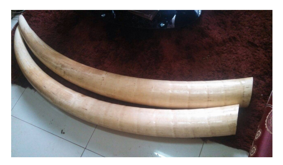
Ivory stolen at a private residence in Yaounde ends up in a police station with three arrested.