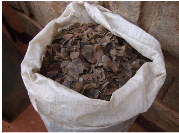
Bags of giant pangolin scales mixed with other pangolin scales seized from notorious female trafficker in Yaounde. Giant pangolins are totally protected species