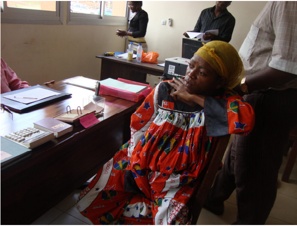
Above woman arrested with 4 bags of giant pangolin scales mixed with other pangolin scales. This is not her first act as she had been arrested in December 2012 with gorilla limbs