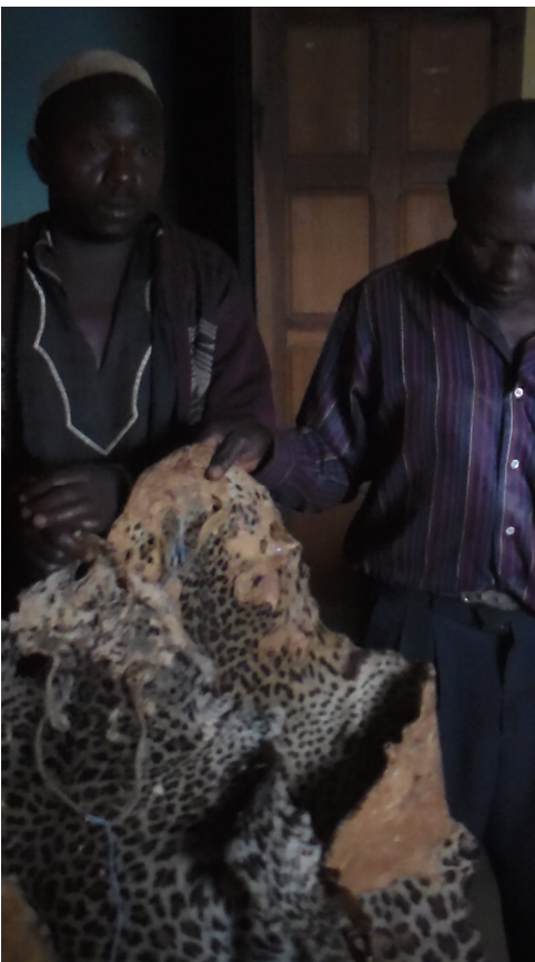
Left, two major traffickers arrested while trying to illegally trade in leopard skin. They are suspected to having connections to the illegal trade in leopard skin in a the West Region that has witnessed the arrest of numerous traffickers in leopard skin within the last 3 months. Right, Leopard skins seized from traffickers.