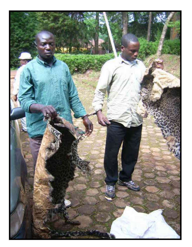
Leopard skins dealers arrested in Dschang with two leopard skins