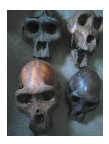
Four gorilla skulls hidden in a knacksack were unveiled as ape traffickers arrested