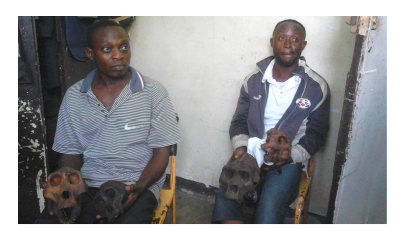
Arrested in the capital city Yaounde by wildlife officials working with police officers as they attempt to sell gorilla skulls