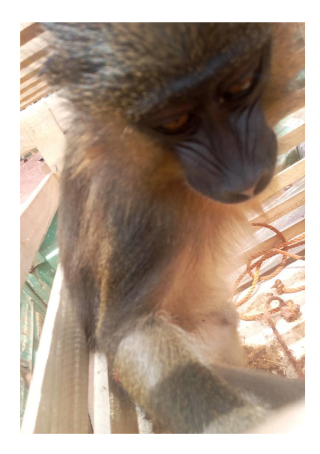
Rescued from trafficker in a bustling neighborhood in Yaounde