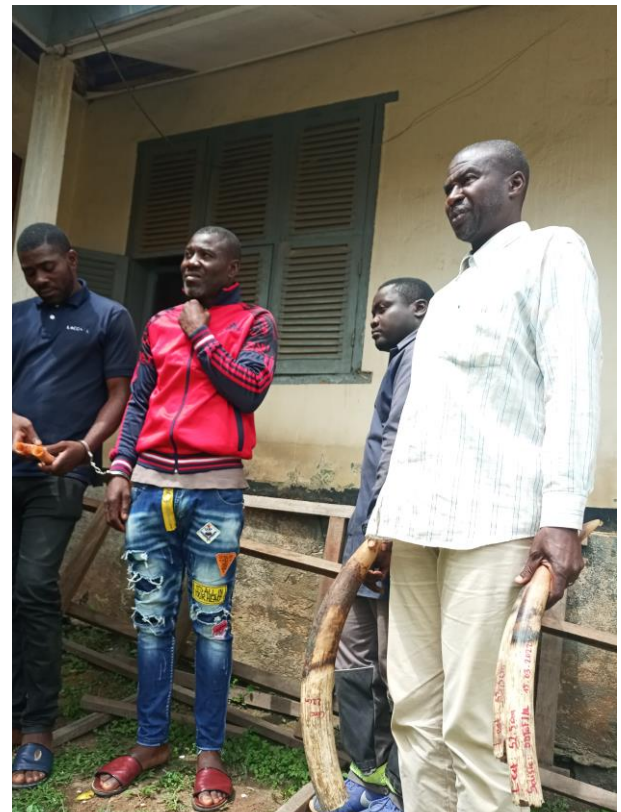
A gang of ivory traffickers arrested in the South Region shortly before prosecution begins.